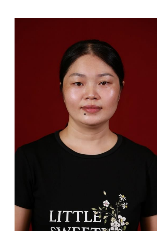
K3D Classroom Assistant